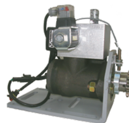
Hydraulic motor with electronic control