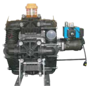
Pump for liquid applications