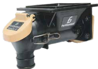
Volumetric doser for granular